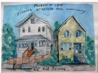
Painted and donated by Jemima from Midtown Church

We're blessed to offer a clean and nurturing environment where men can rebuild their health, confidence and freedom from substance use.